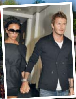
The Beckhams loved their family holiday in Portugal